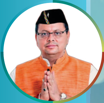
Shri Pushkar Singh Dhami Hon'ble Chief Minister of Uttarakhand

INNOVATION, COLLABORATION & COMMUNICATION