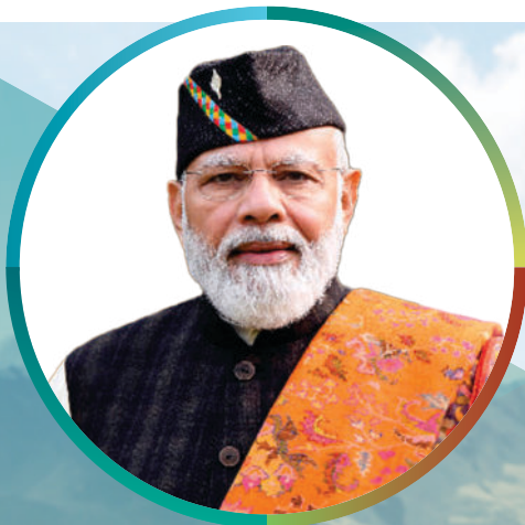
Shri Narendra Modi Hon'ble Prime Minister of India