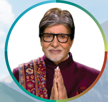
Shri Amitabh Bachchan Ambassador of WCDM